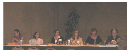
Feminist Publishing panel