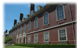
University of Illinois Library

Women and Gender Resources Librarian, University of Illinois, Urbana-Champaign