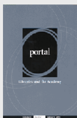
Cover of Portal